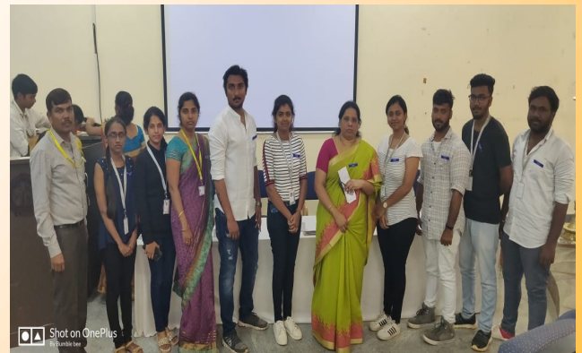
All the office bearers of ECE Department Association