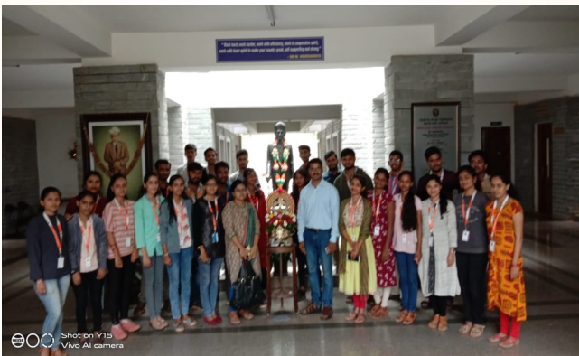
Students at VTU regional centre for workshop on Aerospace